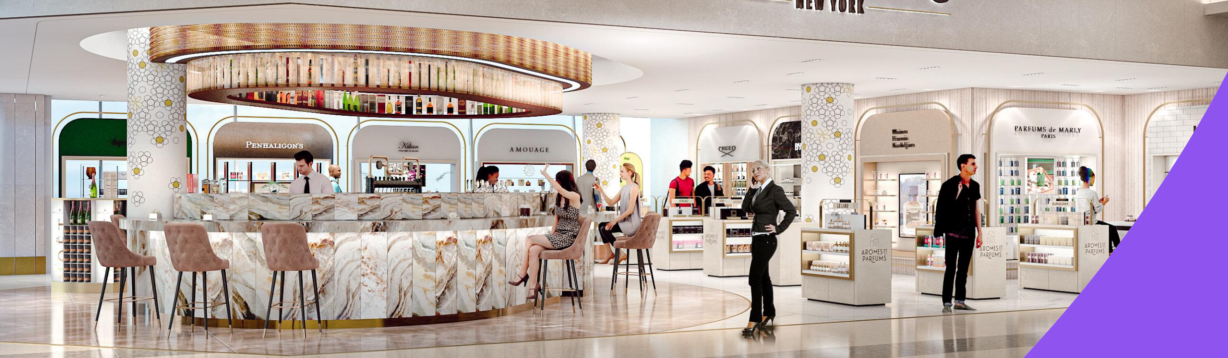
Bubbles on Fifth – JFK T8 International Airport ( Opening Soon)