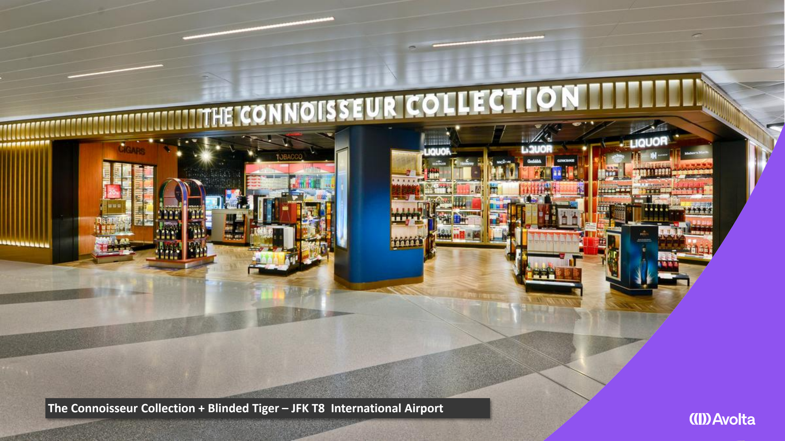
The Connoisseur Collection + Blinded Tiger – JFK T8 International Airport