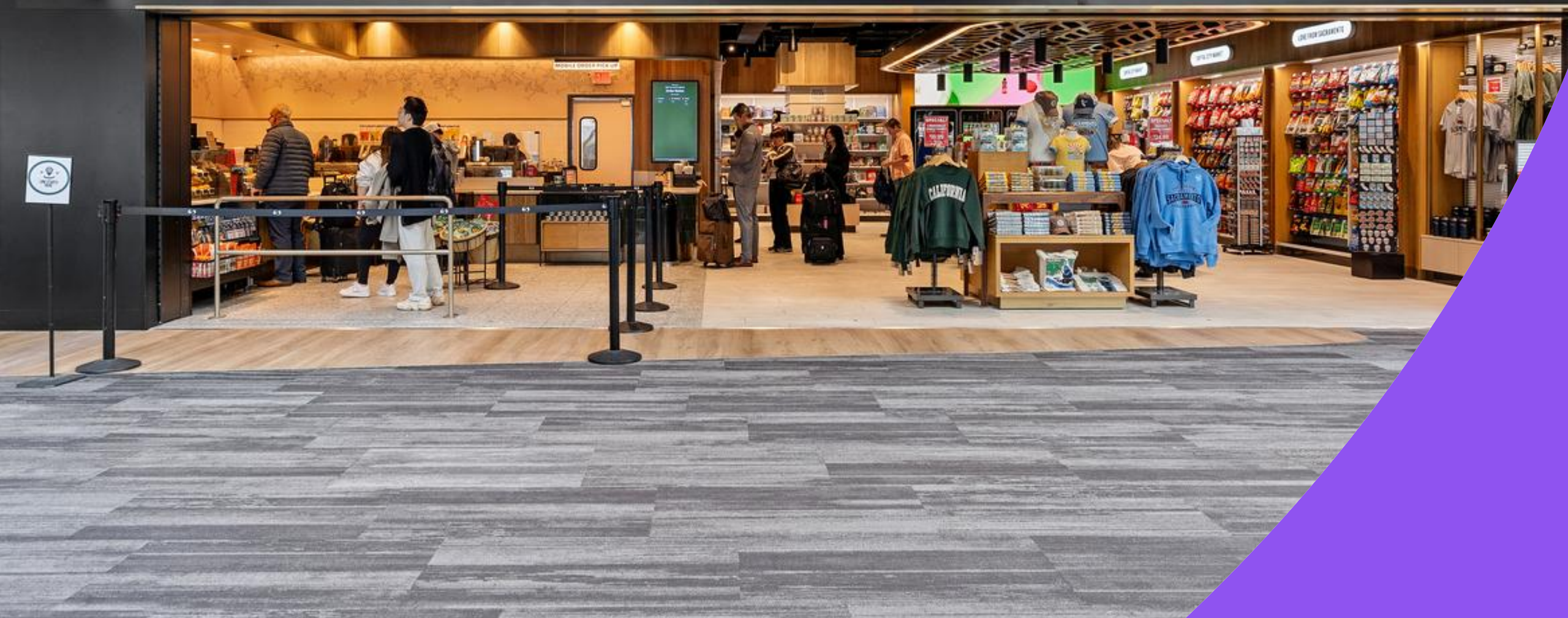
Starbucks + Golden Grove Marketplace – Sacramento International Airport