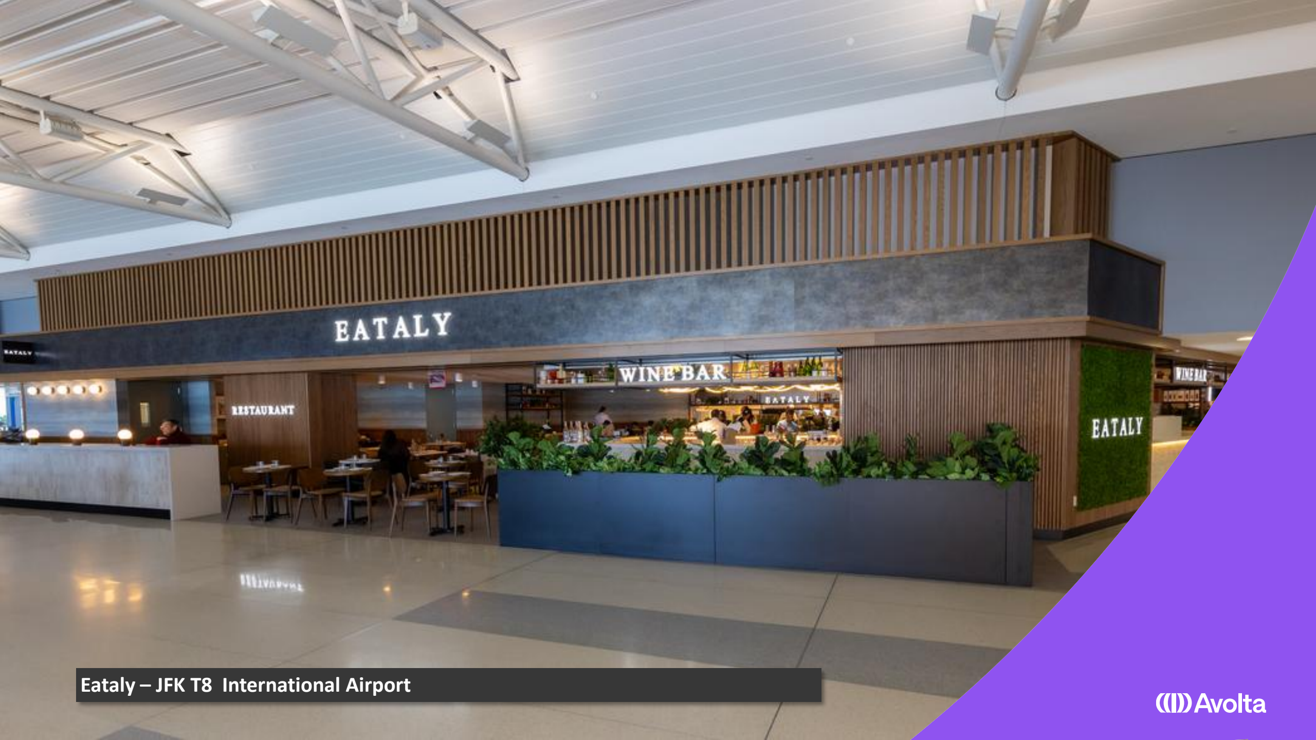
Eataly – JFK T8 International Airport