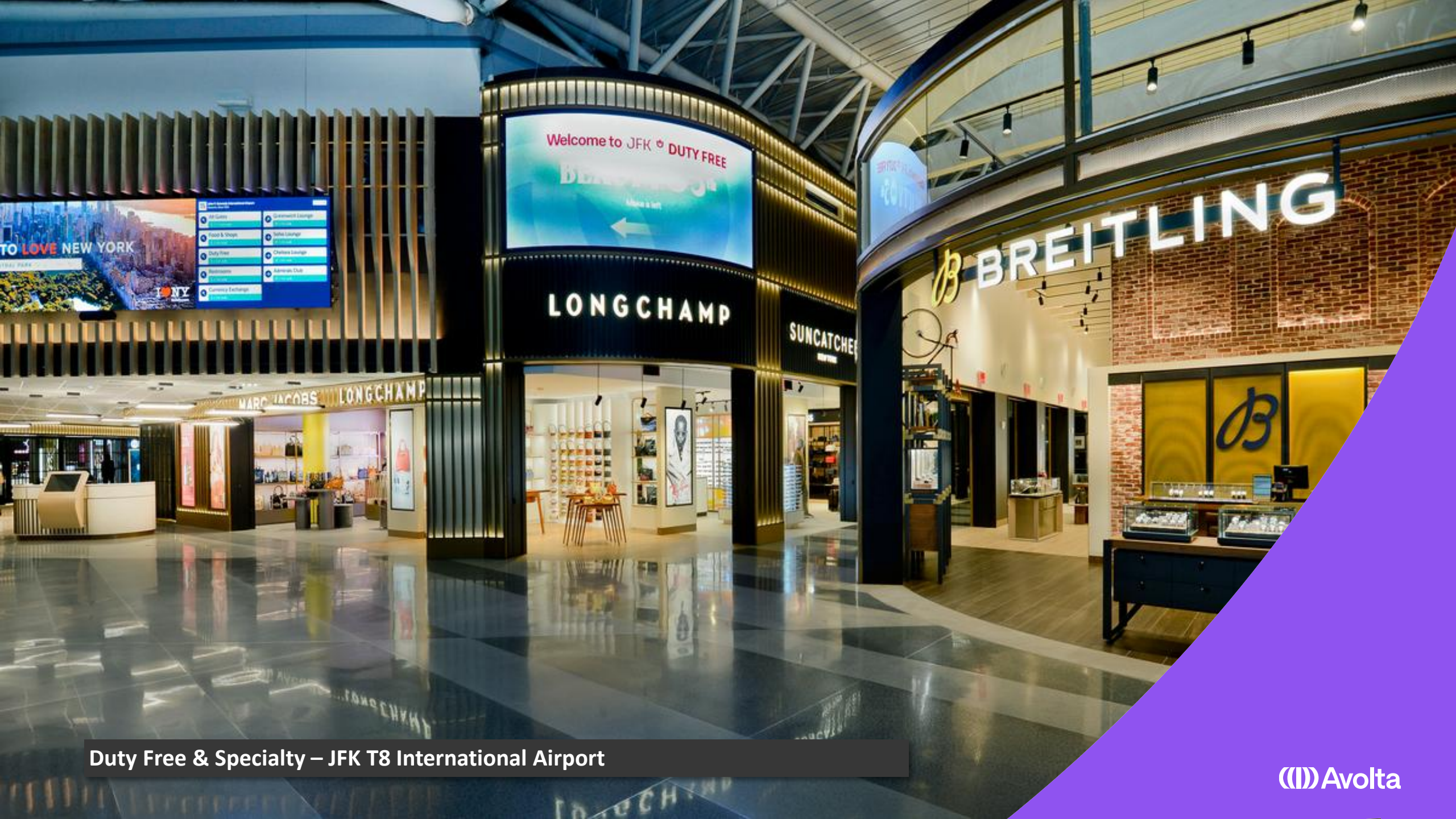
Duty Free & Specialty – JFK T8 International Airport