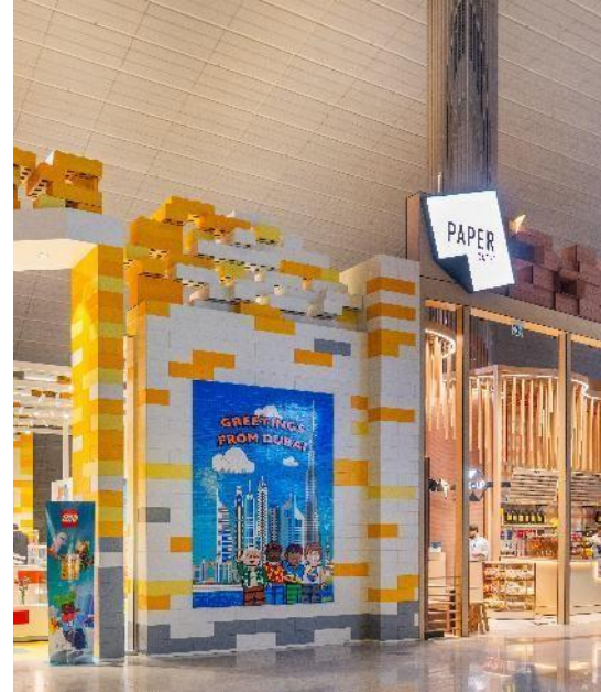
Lego & Paper cafe Lego store & café concept Dubai International Airport