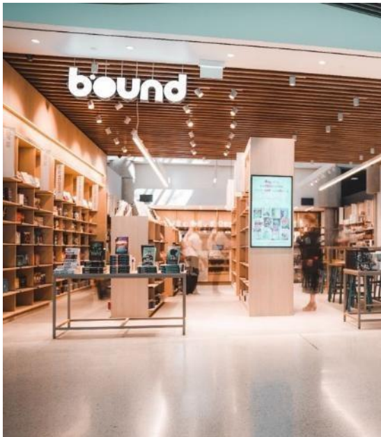
Bound Fashion & bar concept Brisbane Airport