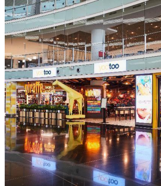
Yootoo Giraffe Restaurant & Comics Bookstore Barcelona Airport