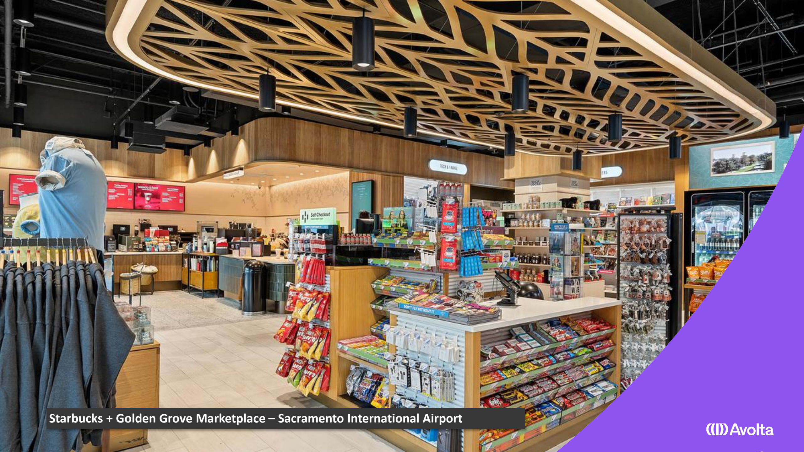
Starbucks + Golden Grove Marketplace – Sacramento International Airport